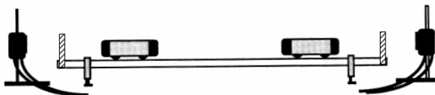
Figure 10.1. Setup for 1-D Collision